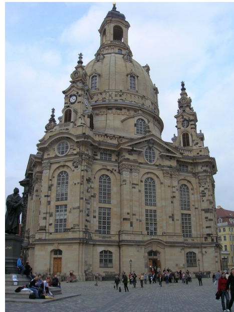
The Frauenkirche in Dresden

title page read: „The Church Day – Joyful, Pious – and Political!“