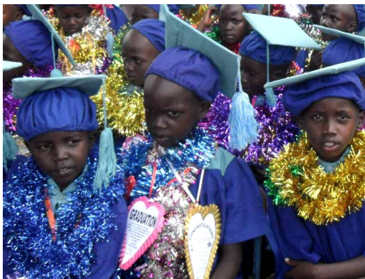
Chesongoch Kindergarten Graduation

At the Kindergarten in Chesongoch, there were prizes given also for free public speaking and an impressive group of Scouts.